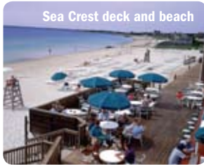
Sea Crest deck and beach