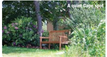
A quiet Cape spot