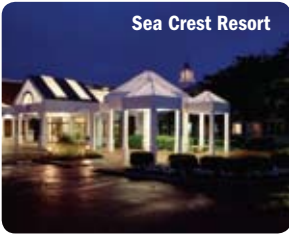
Sea Crest Resort